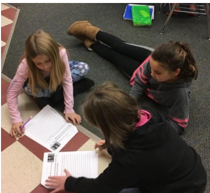
4 th grade students are working together to read about the Great Horned Owl. Our teachers use both fiction and non-fiction to have students make connections and comparisons between the two genres.