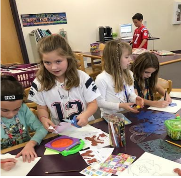
Students experience "maker spaces" at Library as part of the STEM program where they can work collaboratively to design, build, and create.